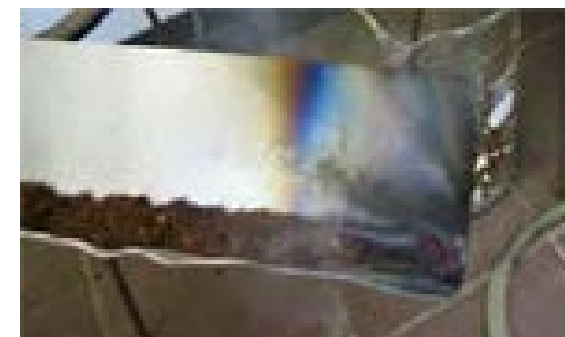
SpillFix Organic after the test (pic A)

Conclusion: The above shows that SpillFix Organic has a greater absorbing capacity and is holding the absorbed oil better. However the two products should be used with caution when absorbing flammable spills.